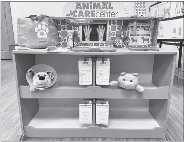
The Danville-Center Township Library added a veterinarian play center, as well as a number of books about animals with the Hendricks Humane grant.