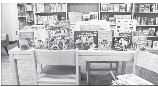
The Clayton-Liberty Township Library displayed some of the new children's books purchased with the Hendricks Humane grant.